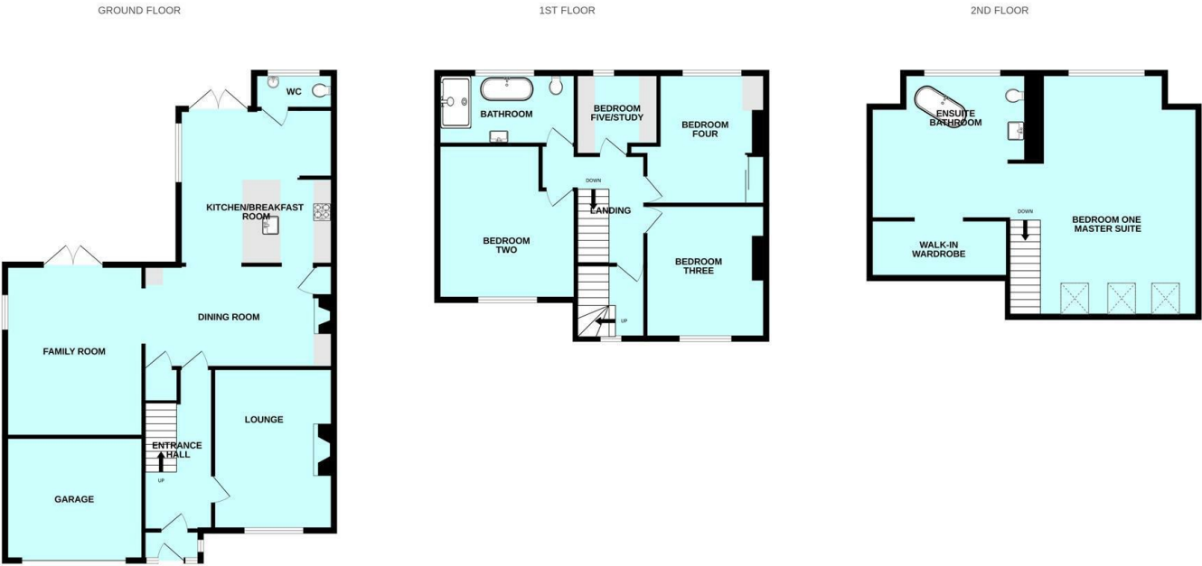
Made with Metropix ©2025

Please contact our Plymouth Office on 01752 401128 if you wish to arrange a viewing appointment for this property or require further information.